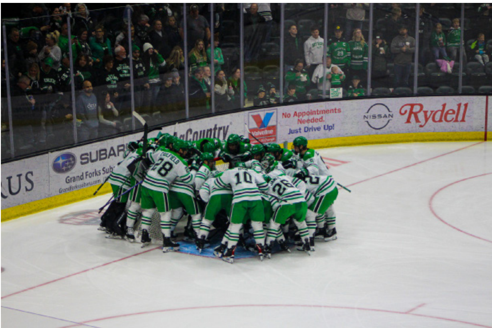
The UND Men’s Hockey team huddles up during one of their many fan-filled home games at the Ralph.