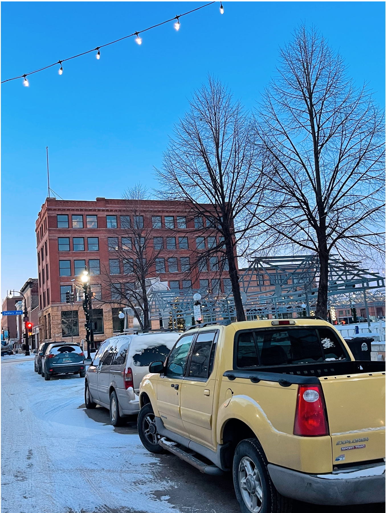
It is important to keep up on your vehicles maintenance to ensure it runs smoothly throughout the winter months in ND.

The next step to checking tires on a vehicle is making sure you have the correct type of tire installed on the vehicle. There are a large number of tire manufacturers and each of them carries multiple different tires fulfilling different roles of driving. Tires can range from touring tires, suited for summer road driving in fair weather condi-