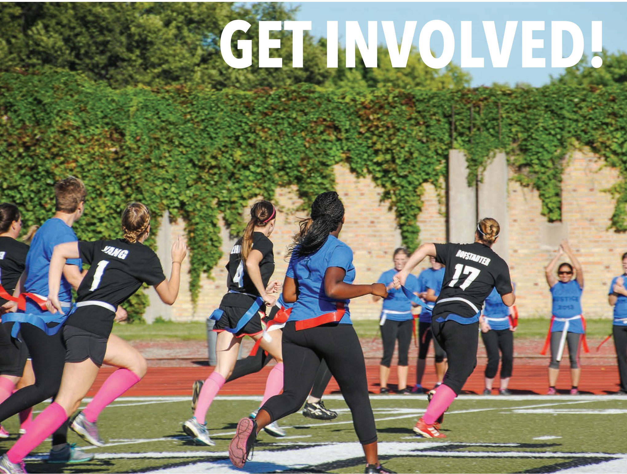
(Top and Bottom)