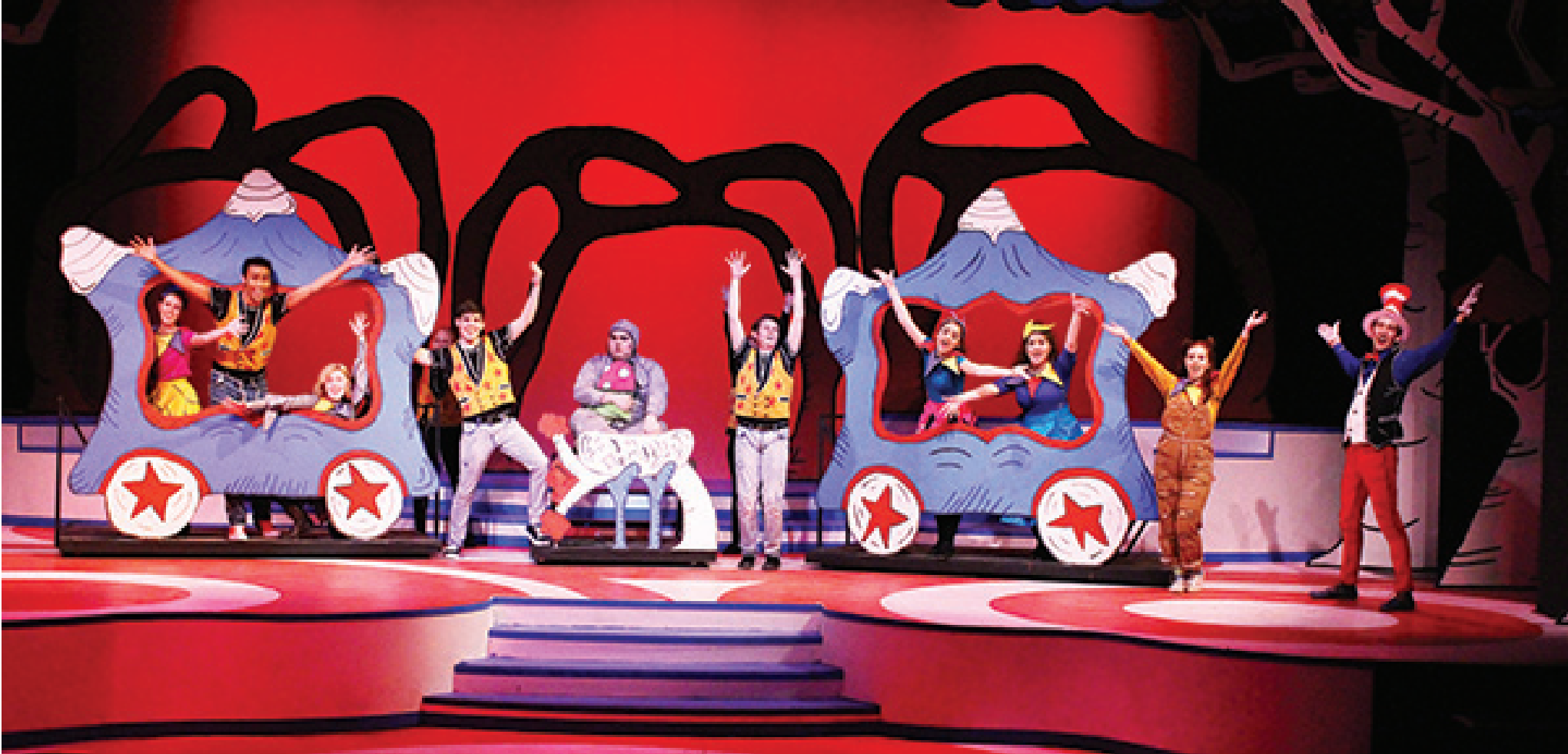
UND Theater students perform a production of “Seussical” based off of Dr. Seuss’s children’s stories.