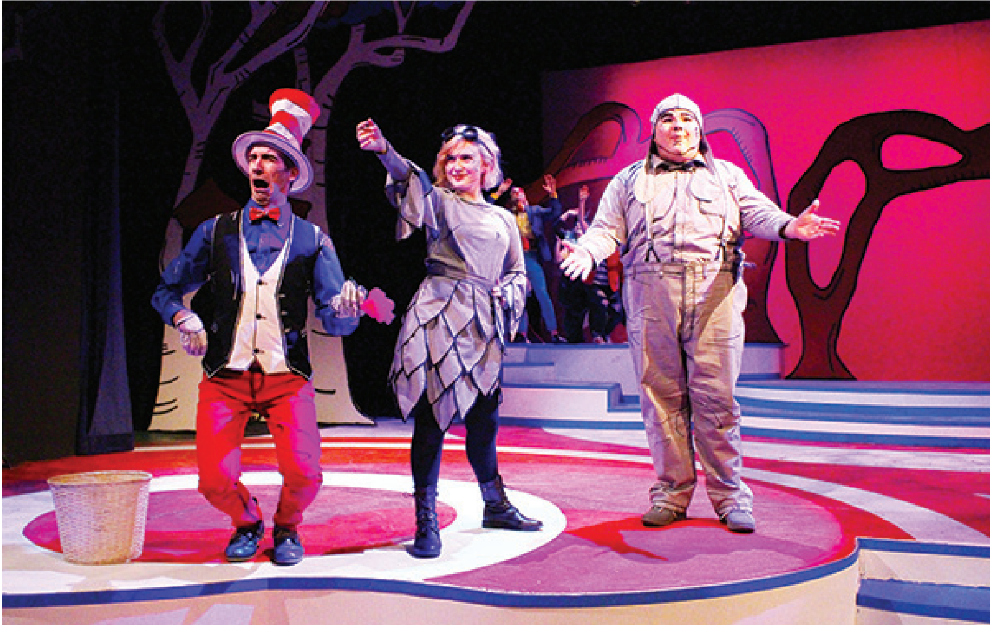
UND actors during a scene of the production “Seussical.”