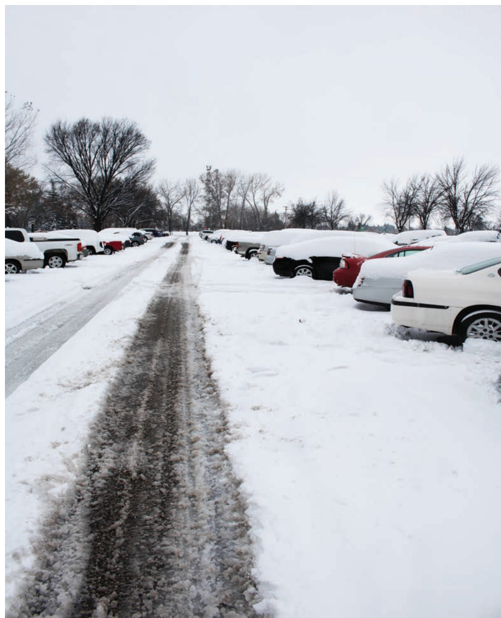
A full parking lot on campus.