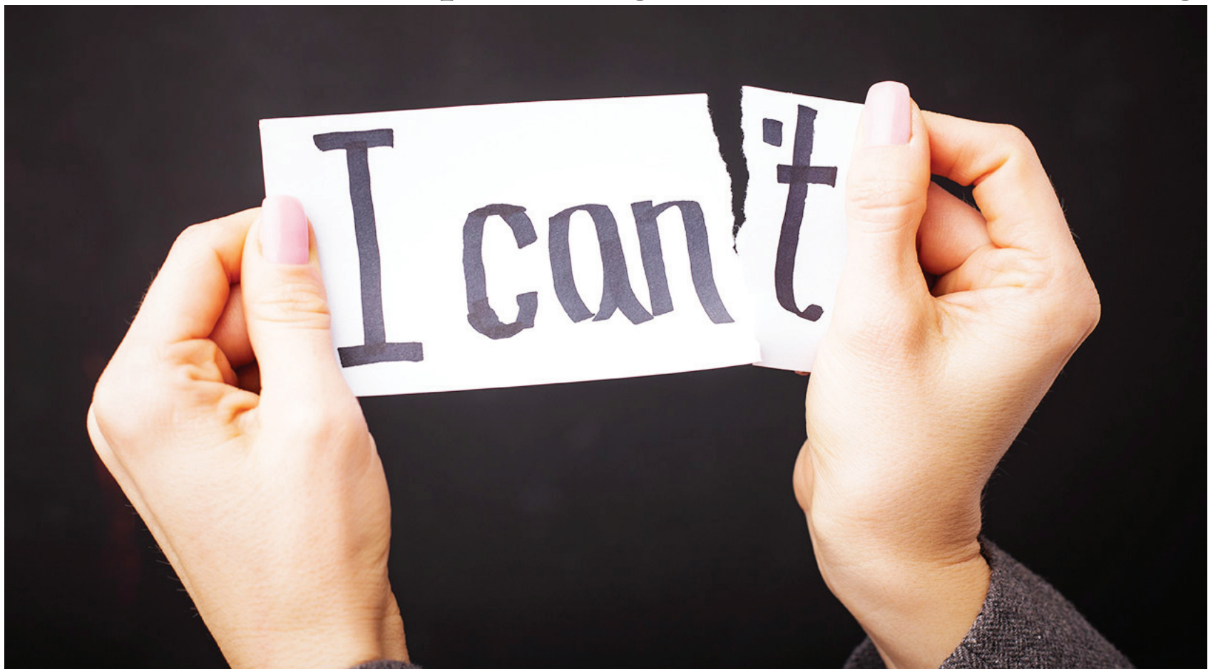
A positive way of thiking in regards to changing your mindset.

"I don't FEEL like working out, I don't FEEL like waking up earlier, I don't FEEL like going to a career fair", well guess what if you want to better your life, you will have to do and achieve things you may not FEEL like doing. If it's going to better your life in anyway, do it. Develop the routine and habit of forcing