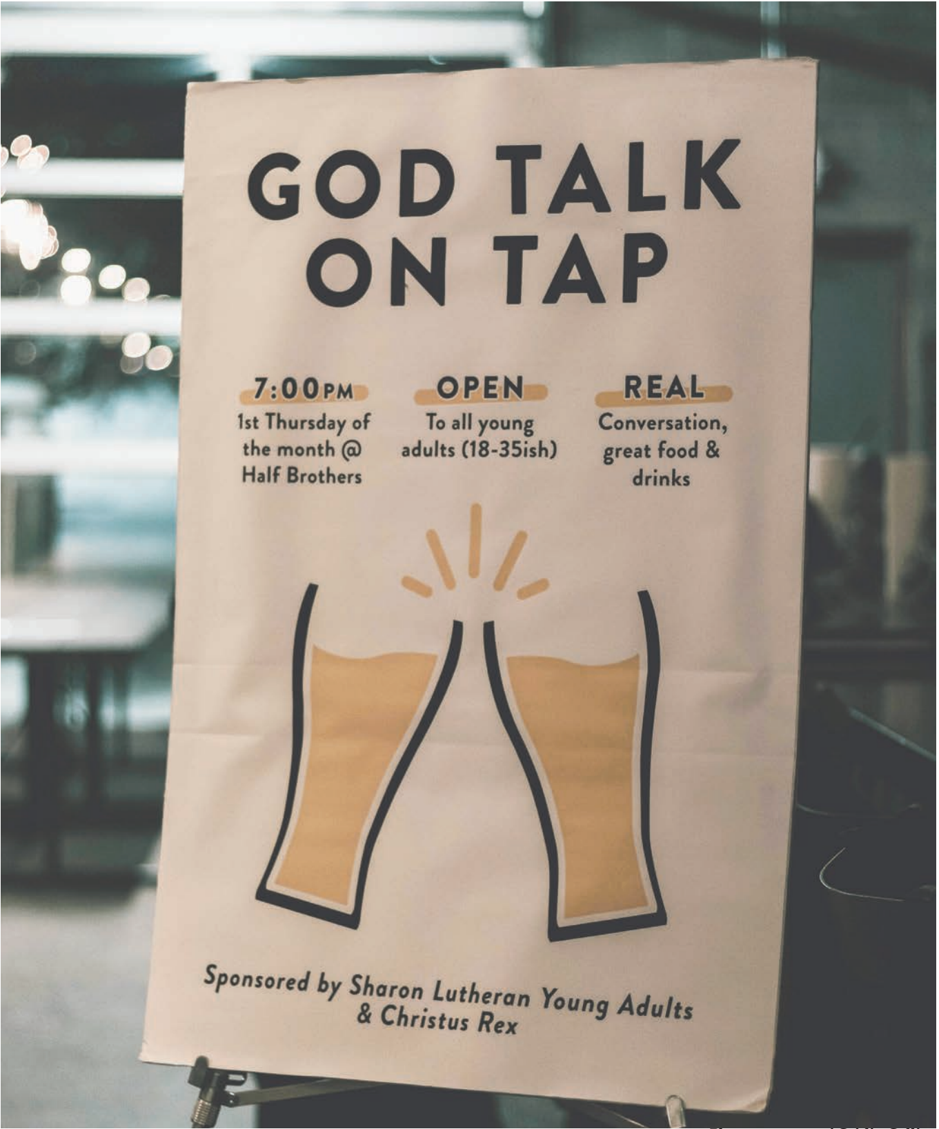
The schedule of God Talk on Tap.

“This represents a chance for us to be a more moderate to progressive group to say, ‘You can be