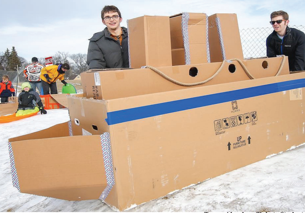
Sledding at the Greenway Ski Day.