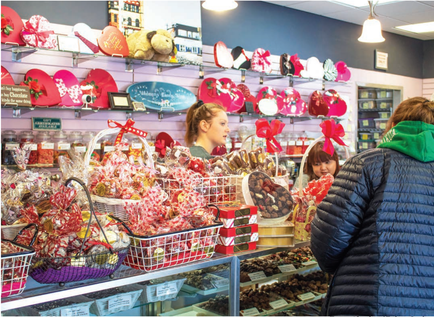
Widman's Candy Store in Downtown Grand Forks is very busy this time of year.