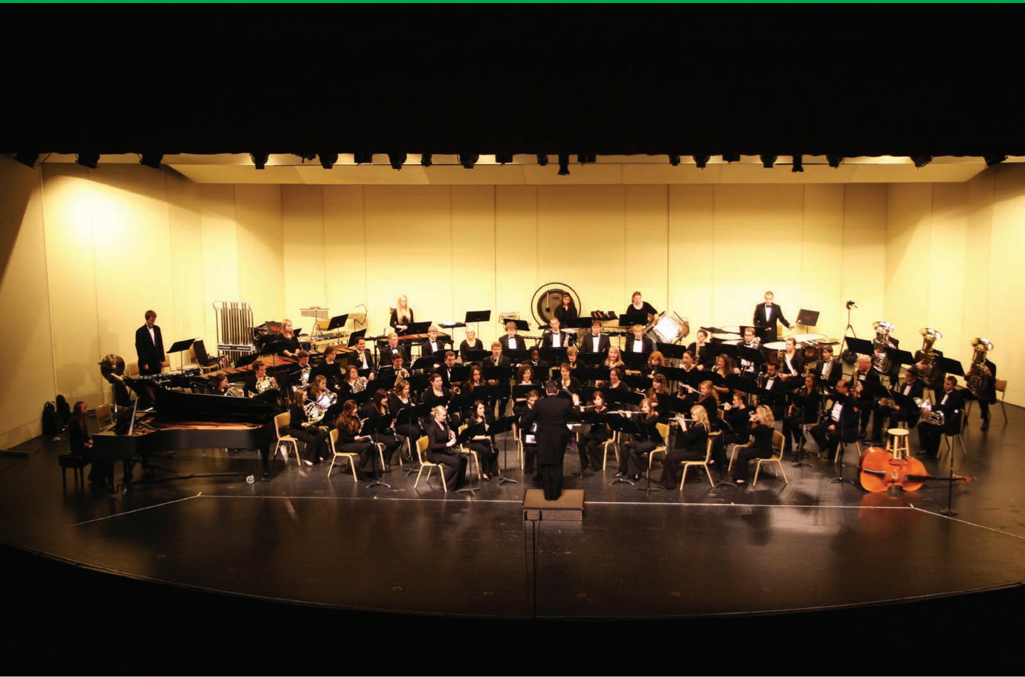
UND Wind Ensemble during their final performance of the fall semester.