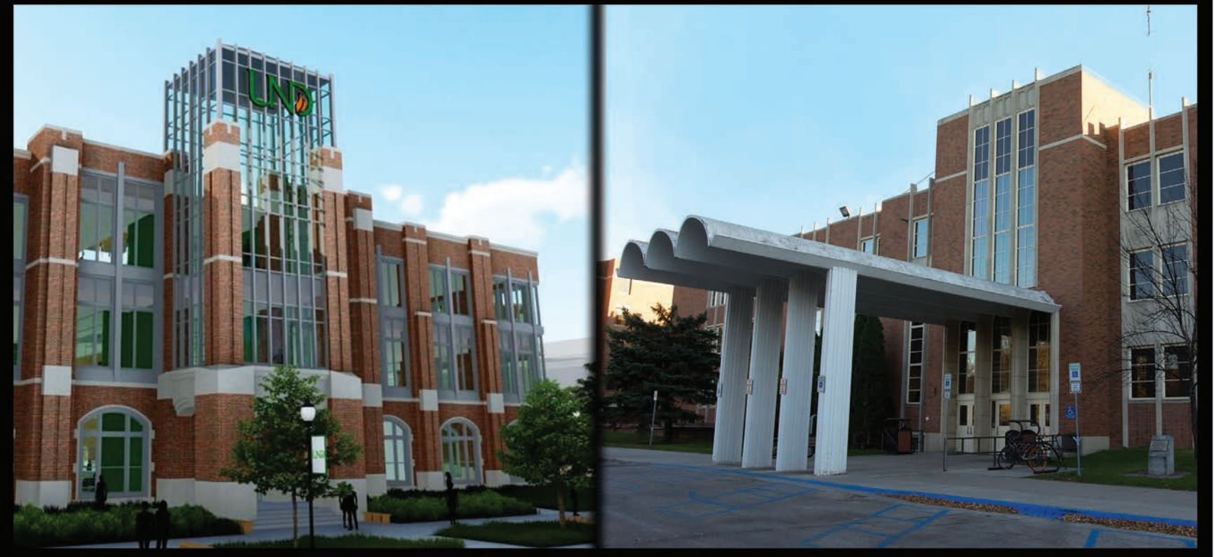
Students voted to make way for an improved Memorial Union.