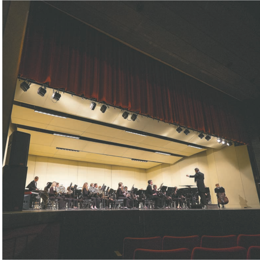
The UND Wind Ensemble performs the final piece of their Tuesday evening concert, "English Dances, Set 1, Op. 27," at the Chester Fritz Auditorium.